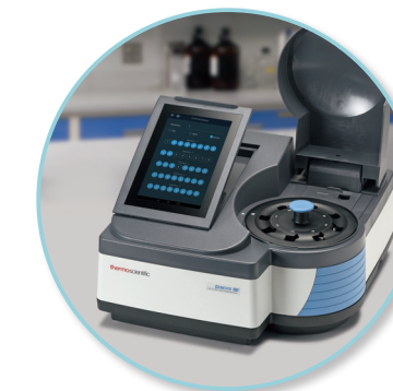
GENESYS 180 UV-Vis Spectrophotometer