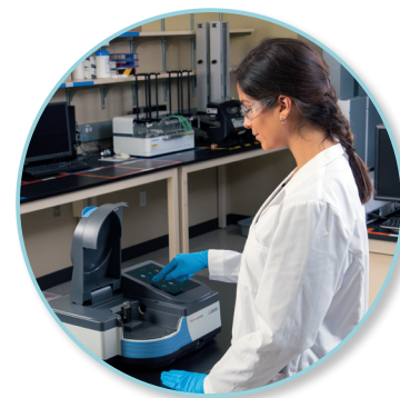
GENESYS 40 Vis/50 UV-Vis Spectrophotometers