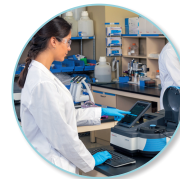
Thermo Scientific™ BioMate™ 160 UV-Vis Spectrophotometer