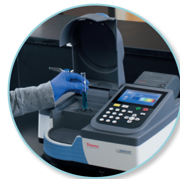
GENESYS 30 Visible Spectrophotometer

For laboratories requiring double beam with a reference cell position.