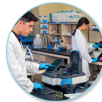
GENESYS 140 Vis/150 UV-Vis Spectrophotometers